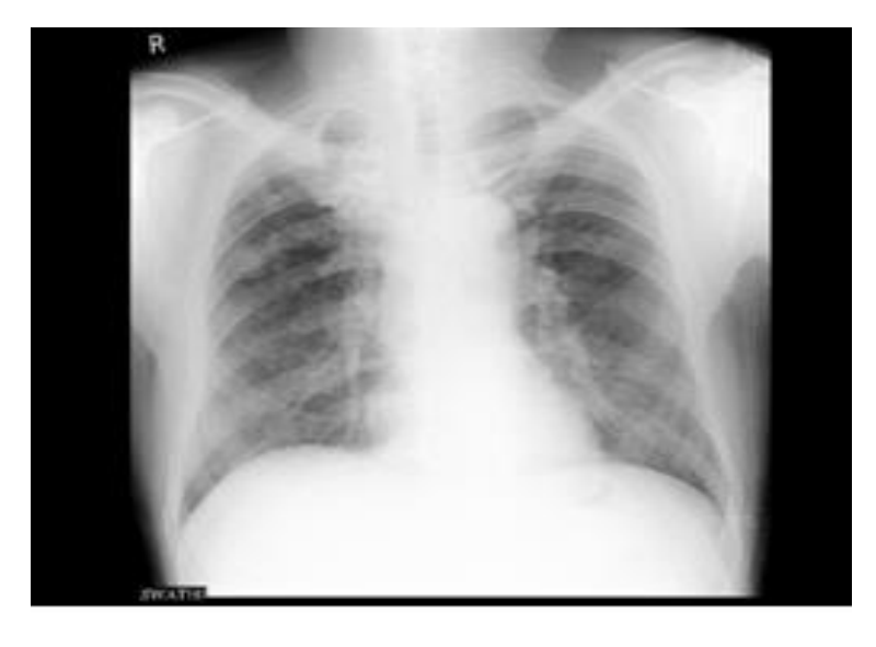
Figure 1: Chest x ray - Right upper lobe opacity with hilar prominence