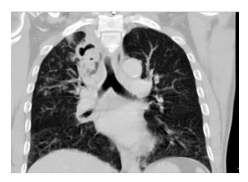
Figure 2: CT scan lungs – cavity formation in right upper lobe apical segment with pseudoaneurysm and centrilobular nodules in both lungs( tree in bud appearence )